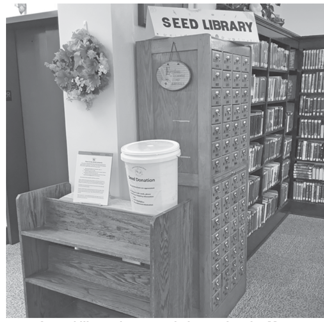
A seed library is currently located at the Monterey-Tippecanoe Township Public Library.