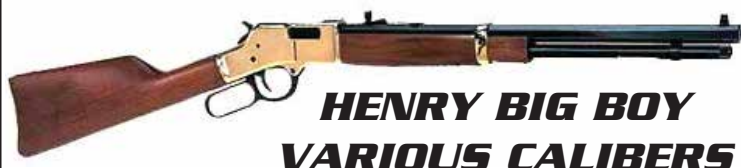
HENRY BIG BOY VARIOUS CALIBERS