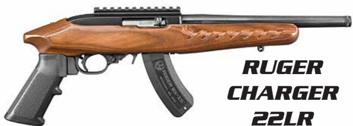
RUGER CHARGER 22LR

With Threaded Barrels, Bipods, Picatinny Rails, 15 RD Magazine, Hard Case