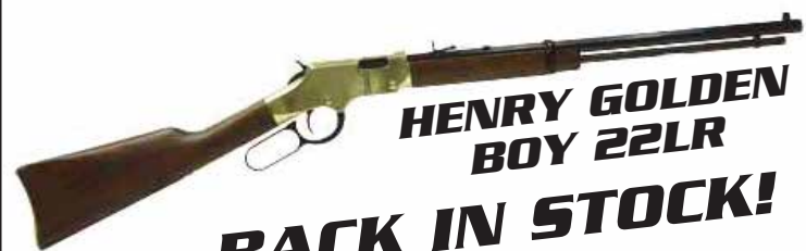
HENRY GOLDEN BOY 22LR