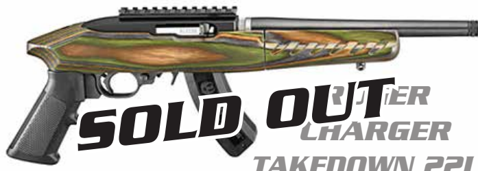
SOLD OUT RUGER OUTIER CHARGER TAKEDOWN 22LR